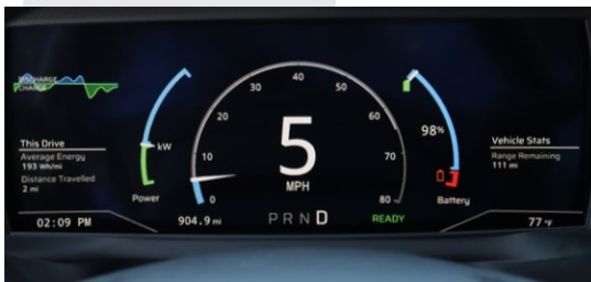
Lightning's digital dashboard provides all the information the driver needs