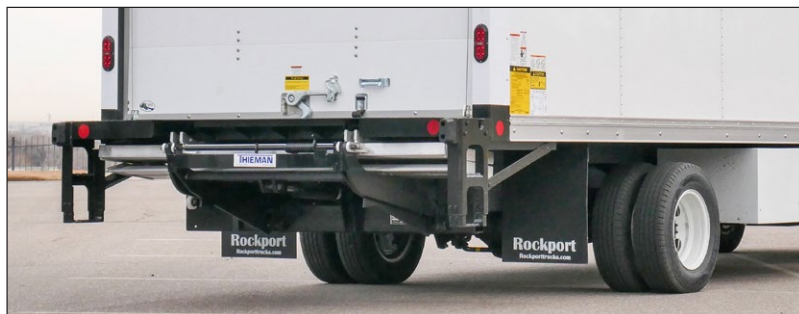
Cargo lifts are among the supported upfits for the Lightning ZEV4 box truck