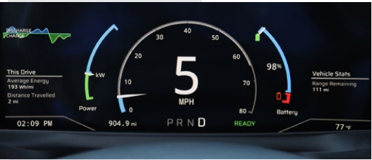
Lightning's digital dashboard provides all the information the driver needs