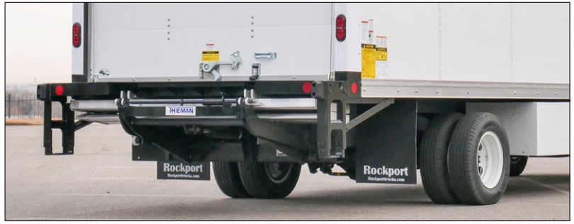
Cargo lifts are among the supported upfits for the Lightning ZEV4 box truck