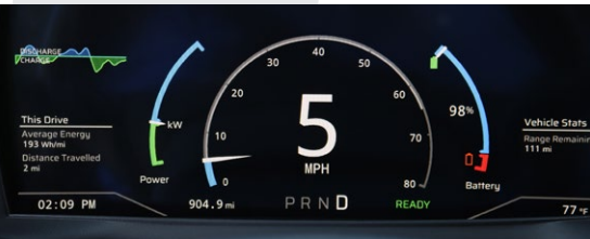
Lightning’s digital dashboard provides all the information the driver needs