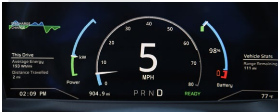
Lightning's digital dashboard provides all the information the driver needs