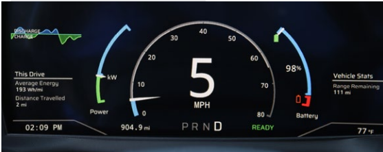
Lightning's digital dashboard provides all the information the driver needs