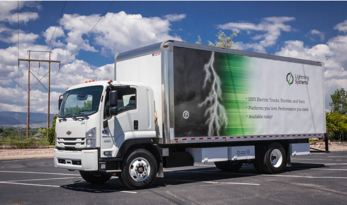
Not the same thing as an electric passenger car.